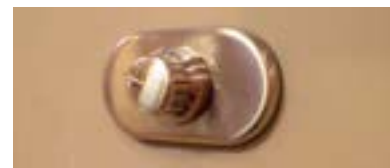
Figure 1: Wire the switch based on the wiring diagram below.