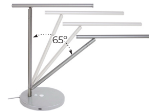
Post Pivot Range: 65° Vertically